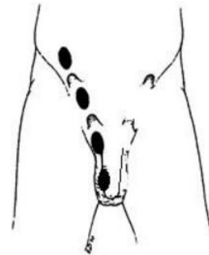
Normal Testicular Descent

Before birth, the testicles form behind the abdominal cavity and go down through an opening in the groin (the inner area of the hip between the stomach and the thigh) muscle to get to the scrotum. As the testicle passes through the groin muscle, the testicle pulls the lining of the abdominal cavity through an opening in the groin muscle and down into the scrotum, forming a sac. When the testicle fixes in the scrotum, the body is supposed to close the sac. In some children the sac does not close and either bowel (intestine) or fluid can go down into the sac. Bowel going in the sac is a hernia while fluid going into the sac is a hydrocele . It is rare for hernias or hydroceles in children to be caused by weakness in the muscle tissues in the groin as is the case in adults.